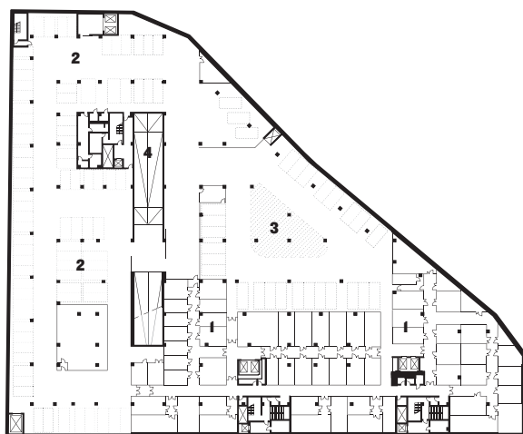
lower ground floor plan