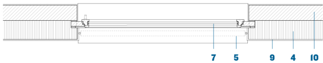
facade details and detailed sections through external wall