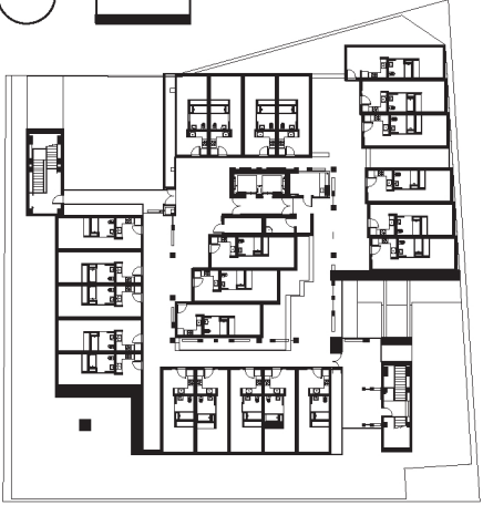
second floor plan